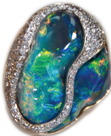
Fashion Q+A UK Voted Editor's Choice 2013 Spectrum Awards