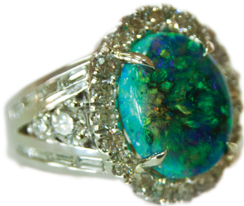
AGTA 2014 Spectrum Award Winner Classical Division, Platinum Honors

Celebrate the year of the opal with an exclusive and profitable showing of the Lightning Ridge Collection at your store!